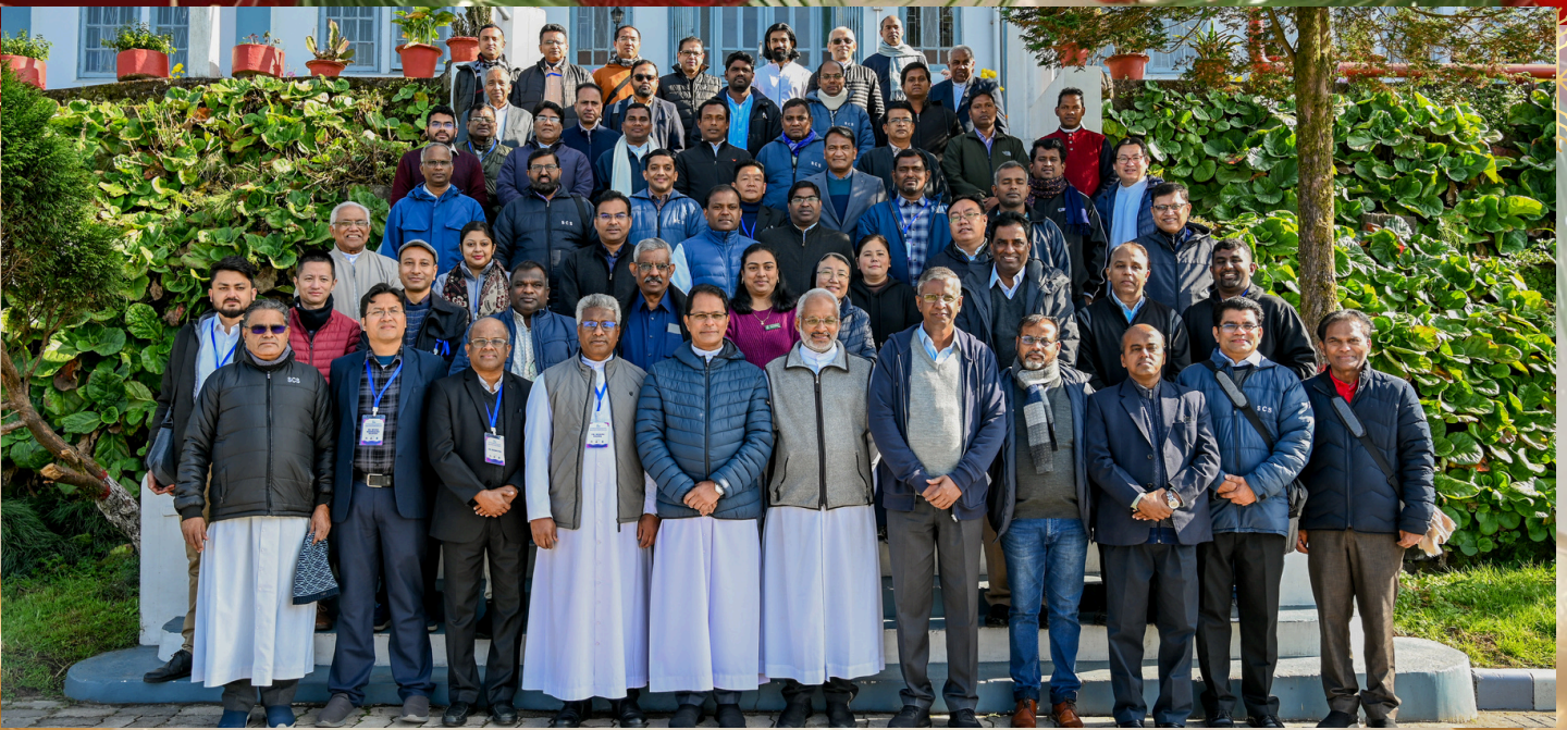
Salesian College Sonada, (Autonomous) hosts Annual DBHEI meeting