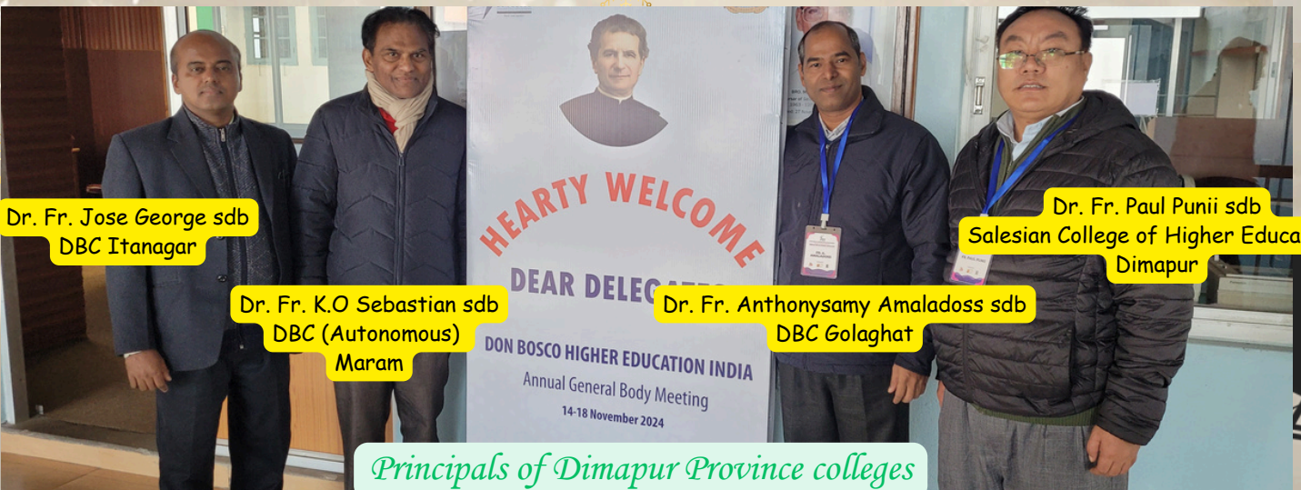
Principals of Dimapur Province colleges