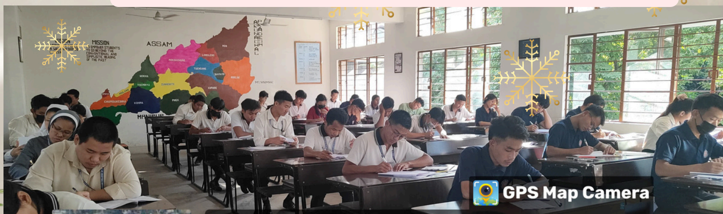
Students writing ODD Semester NU Exam, 2024

NB: The Odd semester results will be declared on the 18th of December 2024