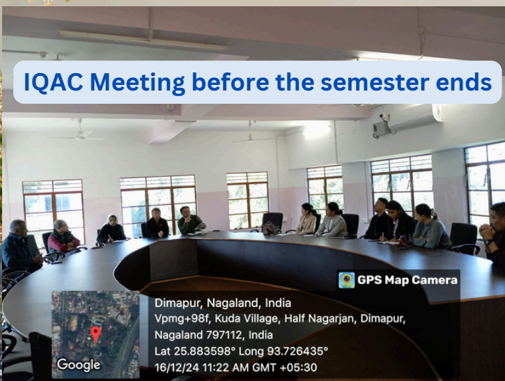
IQAC Meeting before the semester ends