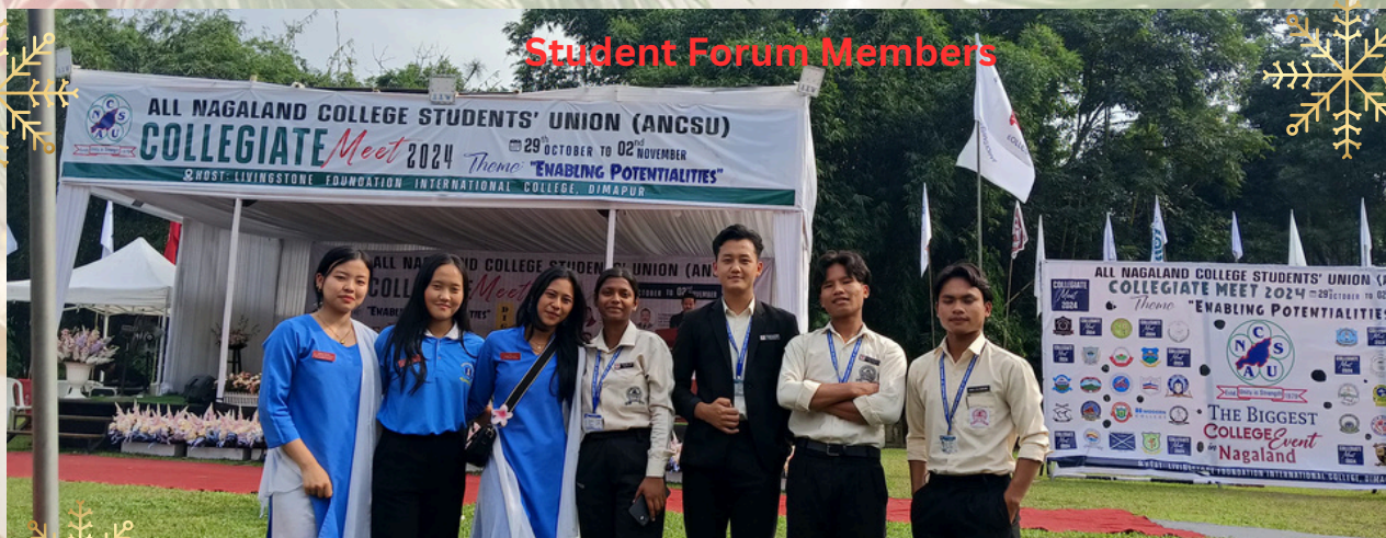
Student Forum Members